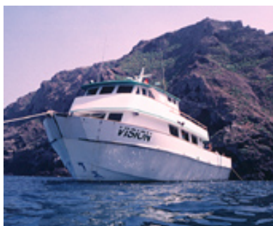
"The Vision" in the Channel Islands