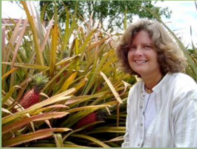
Inspecting pineapples in Oahu