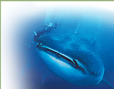
Whale Shark in the Galapagos