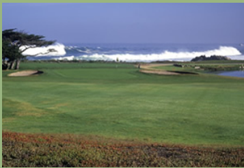
Pacific Grove Golf Course